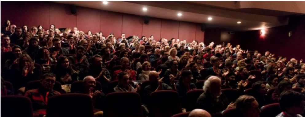
A full house audience of presenters.