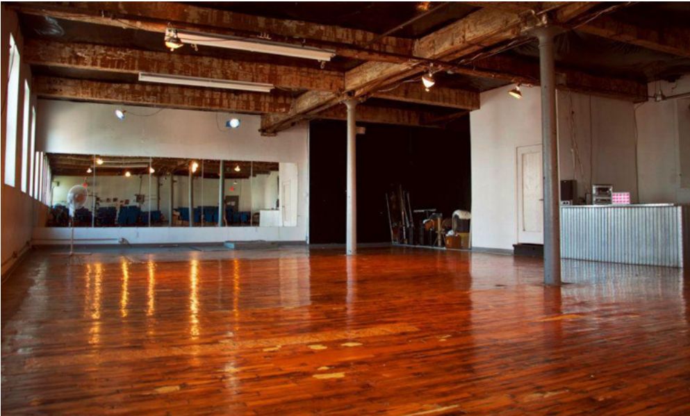
Mascher Dance (a.k.a Mascher Space Cooperative)

Mascher, while much smaller and younger (founded in 2006), is in a similar situation—trying to start more in-house educational programs that support local teachers and secure more engagement and cash flow. Because Mascher is committed to an artist-run structure, there is more fluctuation of staff due to burnout. Working artists never have enough time to do all the administrative tasks to keep the organization growing. One advantage Mascher has over the organizations I encountered at Spring Forward festival is that we can easily scale up or down depending on funding. Small, local, and DIY still seems to be the only possible way to continuously produce, perform, and generate art.