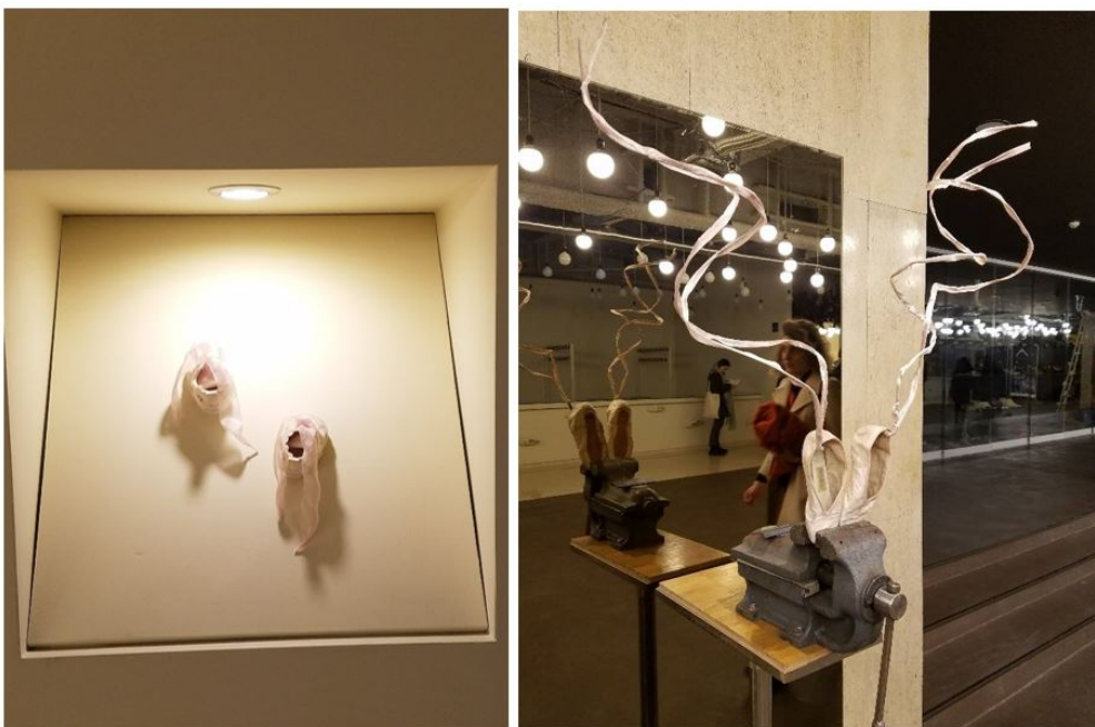
Shoes installations at the lobby of Azarian Theater, Sofia.

U.S. counterparts, on the other hand, are constantly working, sometimes in related but often unrelated labor, to support their dance careers. They teach in many different universities, give private Yoga/Pilates classes, do random administrative jobs, bartend, work as standardized patients, cater, perform bodywork, and much more. This includes dancers and choreographers who work nationally and internationally with companies such as David Dorfman, Bill T. Jones, and Trisha Brown. It is ironic that as a performer one of the most prestigious jobs you can have is dancing with the above companies, yet in the U.S. you still need to have two or three other professions to make ends meet.