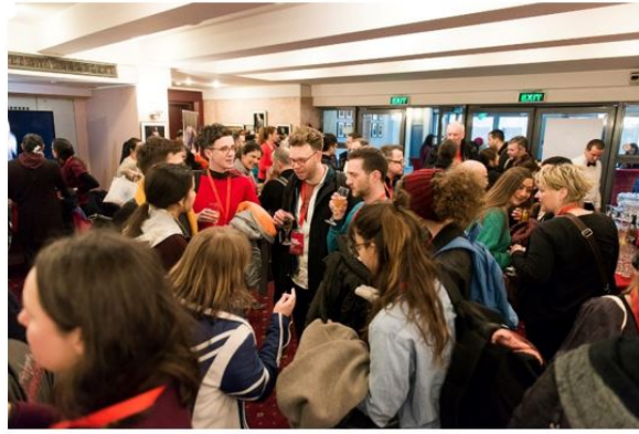
Left: Icicle sculpture found on the streets of Sofia, while going from one venue to the next. Right: Lobby of Nikolai Binev Youth Theater, where presenters mingled, had cocktails and lunch.