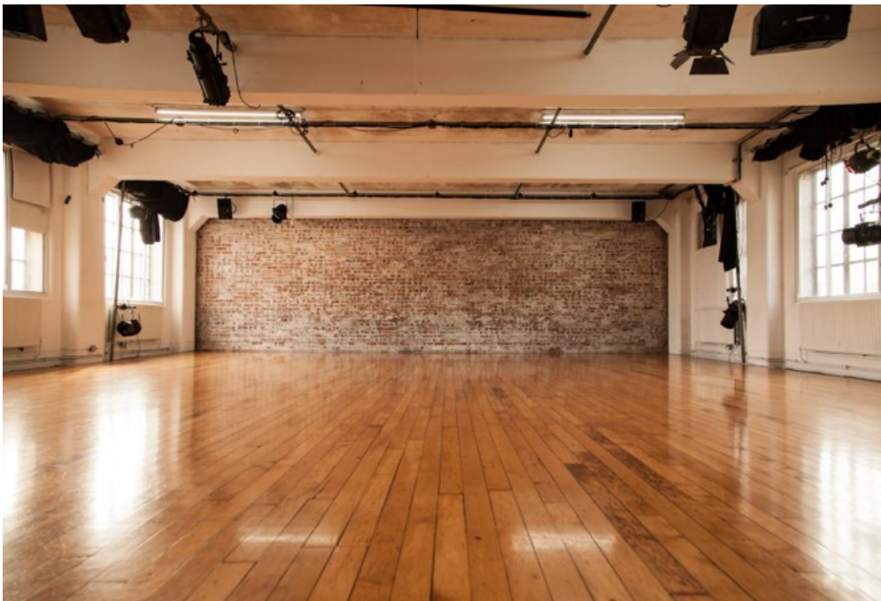
Chisenhale Dance Space, London, UK.