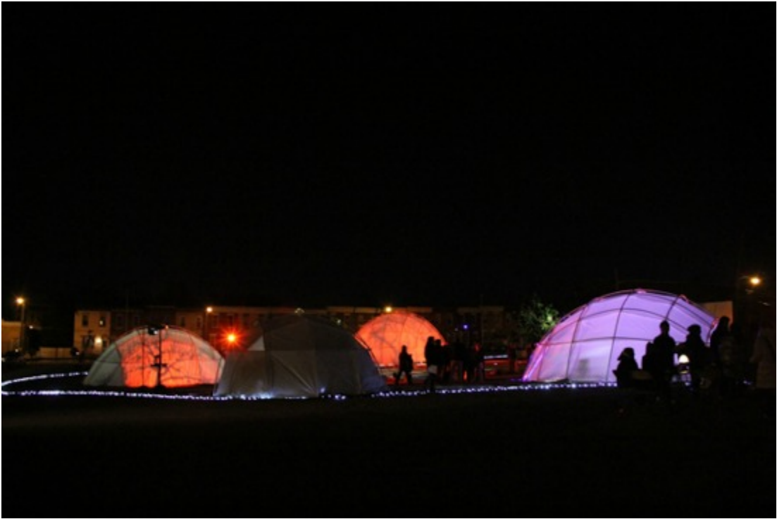
By Lisa Kraus November 4, 2012