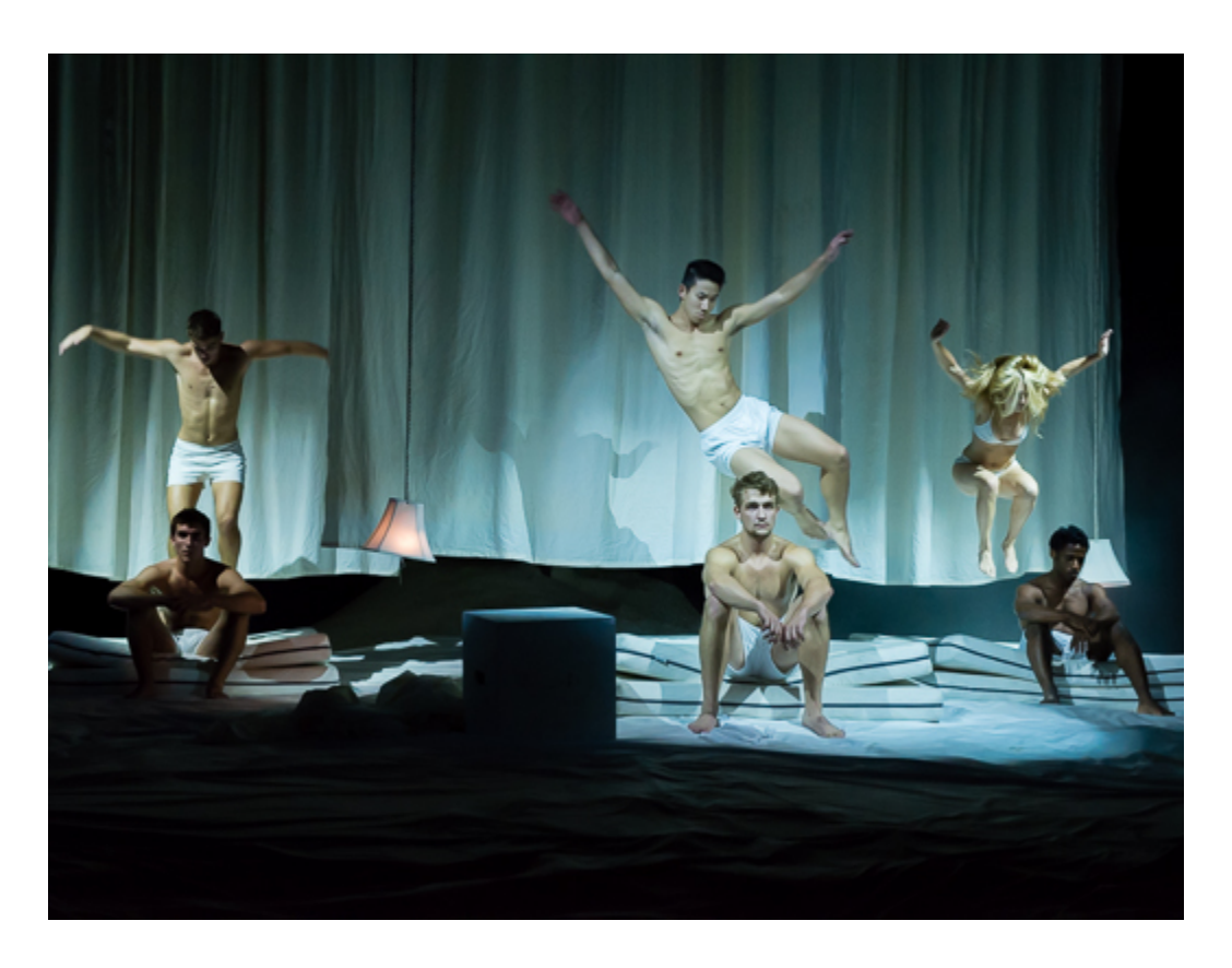
Dress rehearsal of Hush Now Sweet High Heels and Oak.