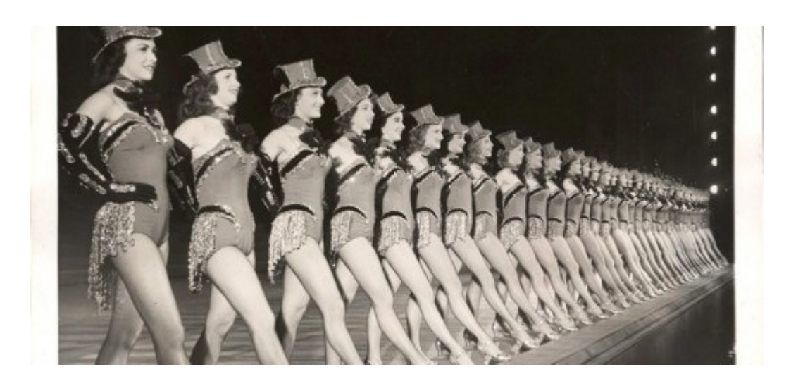
A Rare Collision

Upping the ante on dance coverage and conversation