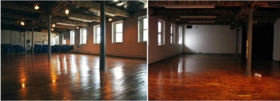
Mascher Space, March 2007.