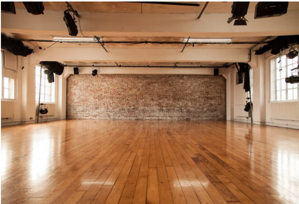
Chisenhale Dance Space, London, UK.