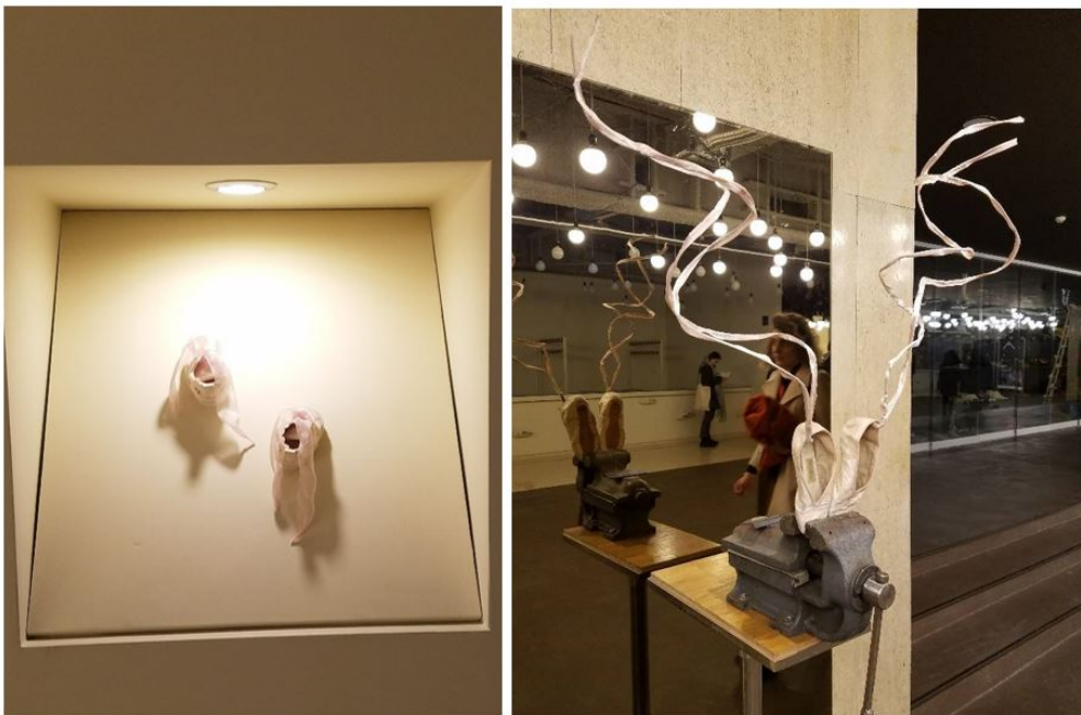
Shoes installations at the lobby of Azarian Theater, Sofia.

U.S. counterparts, on the other hand, are constantly working, sometimes in related but often unrelated labor, to support their dance careers. They teach in many different universities, give private Yoga/Pilates classes, do random administrative jobs, bartend, work as standardized patients, cater, perform bodywork, and much more. This includes dancers and choreographers who work nationally and internationally with companies such as David Dorfman, Bill T. Jones, and Trisha Brown. It is ironic that as a performer one of the most prestigious jobs you can have is dancing with the above companies, yet in the U.S. you still need to have two or three other professions to make ends meet.