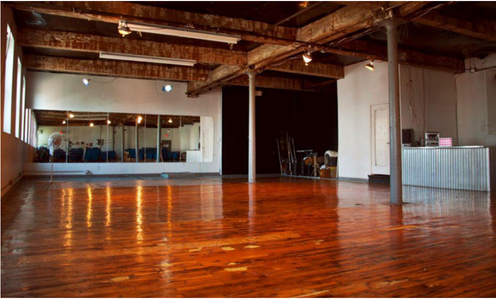
Mascher Dance (a.k.a Mascher Space Cooperative)

Mascher, while much smaller and younger (founded in 2006), is in a similar situation—trying to start more in-house educational programs that support local teachers and secure more engagement and cash flow. Because Mascher is committed to an artist-run structure, there is more fluctuation of staff due to burnout. Working artists never have enough time to do all the administrative tasks to keep the organization growing. One advantage Mascher has over the organizations I encountered at Spring Forward festival is that we can easily scale up or down depending on funding. Small, local, and DIY still seems to be the only possible way to continuously produce, perform, and generate art.