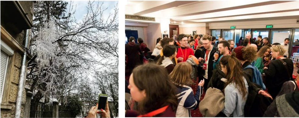
Left: Icicle sculpture found on the streets of Sofia, while going from one venue to the next. Right: Lobby of Nikolai Binev Youth Theater, where presenters mingled, had cocktails and lunch.