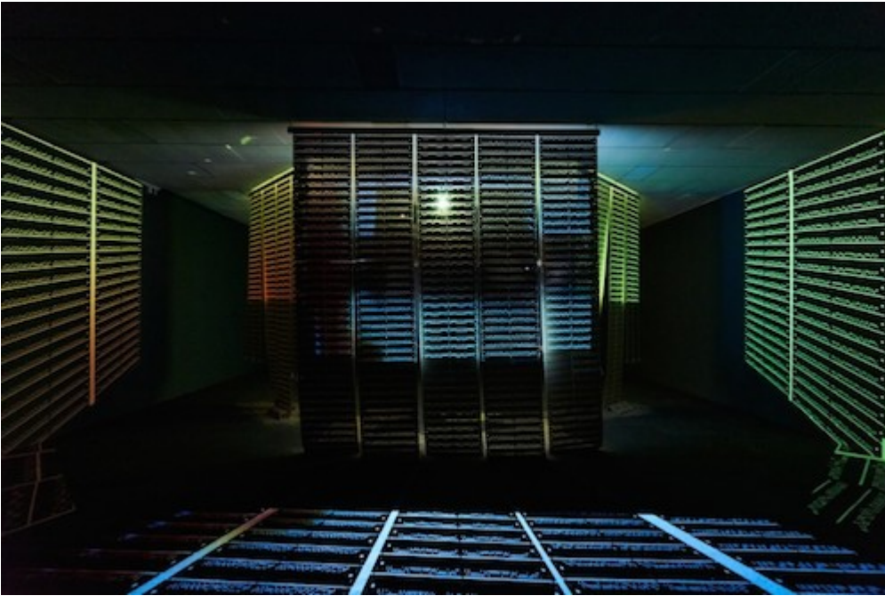
“Warp Trance”, 2007, installation photo: Timothy Tibout

Warp Trance , the final tour de force installation that radiates the dynamism of machines in motion, is a hypnotic video (Nengudi’s first), coming out of a 2007 artist’s residency at Philadelphia’s Fabric Workshop and Museum . Researching local textile mill machine weaving processes, and repurposing the Jacquard punch card panels that, pre-computer, programmed the weaving and patterns of the manufactured textiles, Nengudi projects video of the weaving processes onto three large screens of hundreds of these perforated punch cards. The waves, flutters and jiggles of machines and threads in motion create rhythmic dances of colored light and activated machinery, and also project a layer of inscrutable hieroglyphics from the punched cards. The results are captivating and meditative.