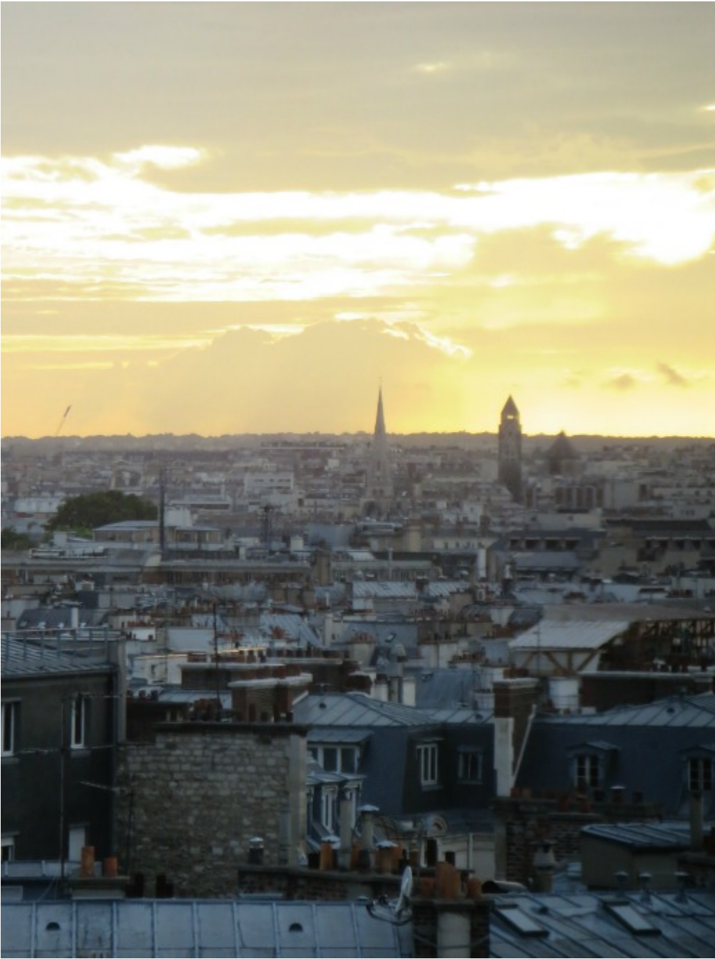
The view en route to Nouredine studio (extreme close up).