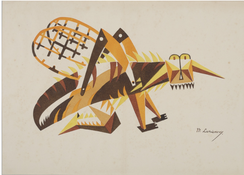
Fiddling Insect: Mikhail Larionov, The Cricket , Mechanical Costume for Histoires Naturelles (1916)

“Was he a beast if music could move him so?” –Franz Kafka’s “The Metamorphosis”