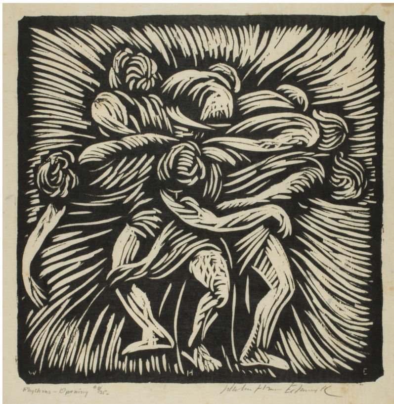
Sweeping Strokes: Wharton H. Esherick, Rhythms, Opening (1922)

A starburst of bodies erupt like the sun into darkness, at its center a circle of dancers. The dance is of one and of many who emerge from common origins into abounding directions. The bodies bloom: curving under, bowing down, arching back, twisting over. Like wheat grass swaying in a field, the energy is light, yet grounded, flexible, but strong. An ephemeral sequence, captured in sweeping strokes both swift and precise, weaves organic curves, offering vitality. The humble glow from braided arms and stretching figures ignites my inner power. Their circuit of durability and grace is within me, is around me, is the world.