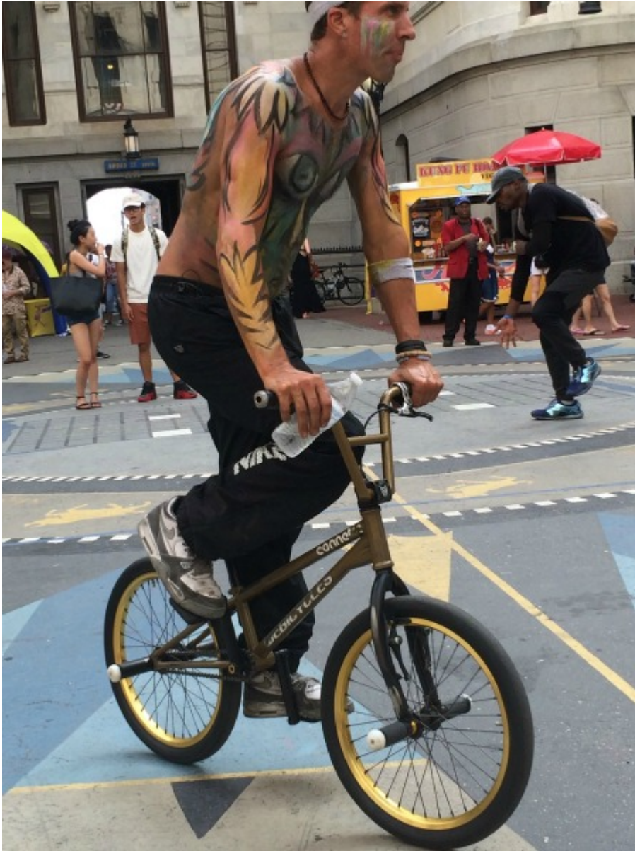
And others attending took advantage of face painting on offer.