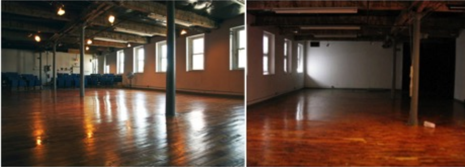
Mascher Space, March 2007.